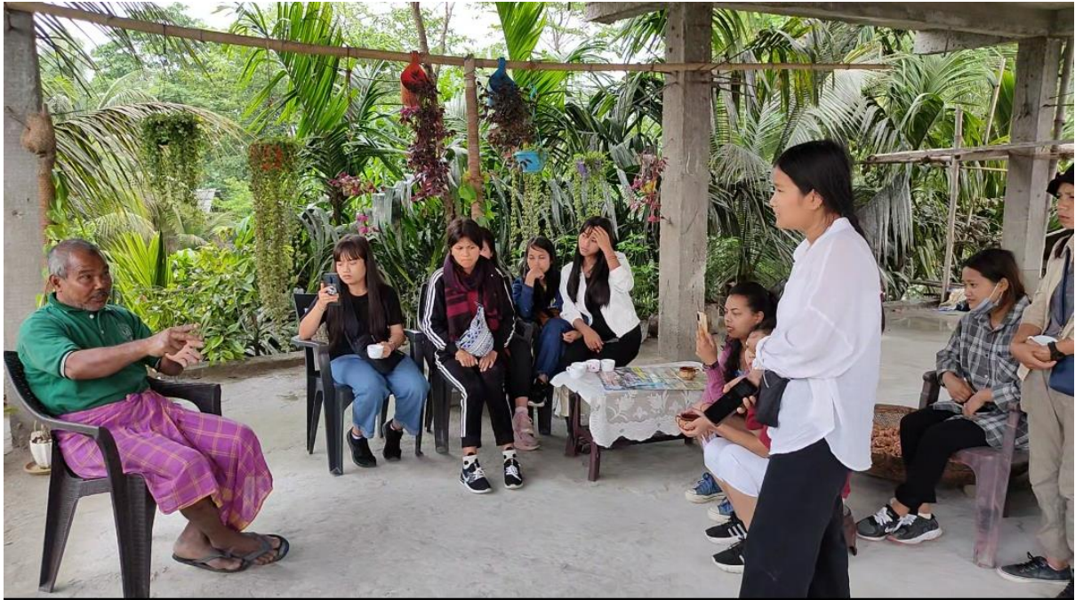
Students interacting with Mr Jadhav Payeng at his residence.