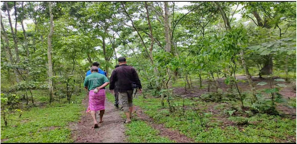
Exploring Malai Forest