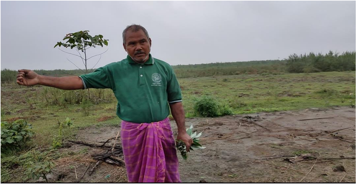
Mr Jadhav Payeng in his forest